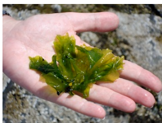
Ulva sp. - Macroalgae